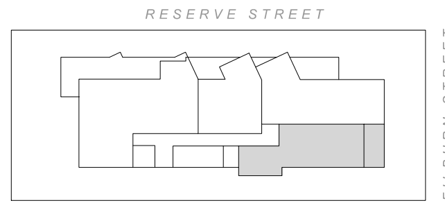
Level 2, 3, 4, 5 & 6

13 Filburn St (Cnr Reserve St), Scarborough